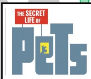
June 16, 2017 "Secret Life of Pets" Sponsored by Chick-fil-a