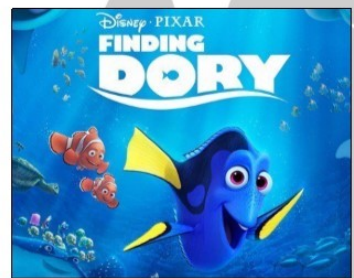
May 19, 2017 "Finding Dory" Sponsored by BCT