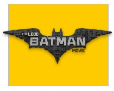
July 21, 2017 "Lego Batman" Jefferson Memorial Park, Charles Town