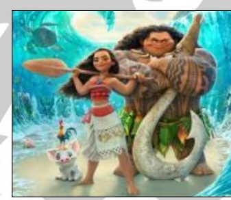
June 2, 2017 "Moana" Blue Ridge Primary