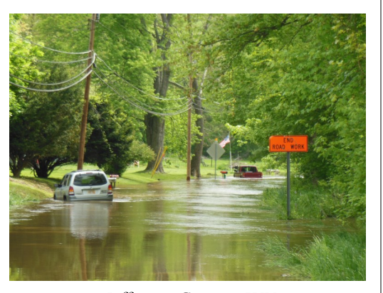
Jefferson County. WV A Class 6 CRS Community.

A Department of the Jefferson County Commission