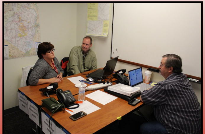
Left: 2018 Functional Exercise. Right: 2017 Full Scale Exercise