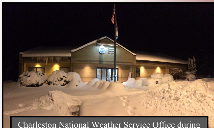
Charleston National Weather Service during Snow Storm Jonas—Jan 2016

Winter Weather Awareness Week is a perfect time for families, communities, schools and businesses to review their plans and to build or resupply their emergency kits. To help that effort, the National Weather Service in Charleston and Jefferson County Homeland Security and Emergency Management will share winter weather preparedness information throughout the week via the web, Facebook and Twitter.