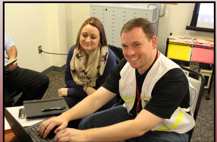
Left: 2018 Functional Exercise. Right: 2018 Full Scale Exercise