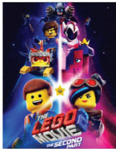
June 21 Lego Movie 2 Sponsored by CNB Bank