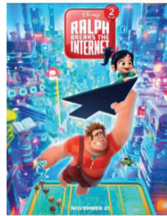
July 19 Ralph Breaks the Internet Sponsored by Creamers Wrecker Service