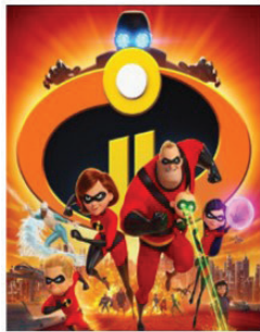
May 17 Incredibles 2