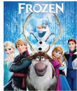
August 16 Frozen