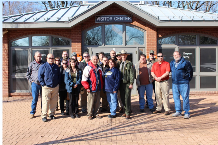
West Virginia Floodplain Managers ready to get on the Shuttle to Harpers Ferry National Historic Park

An instructor team of Federal Emergency Management Agency (FEMA), and West Virginia Homeland Security and Emergency Management (WVDHSEM), Mitigation Division representatives were at the Quality Inn and Conference Center near Harpers Ferry for their L273 Floodplain Management Course at the end of March. Approximately 25 floodplain managers, surveyors, and emergency managers from around West Virginia attended the four-day course. At the end of day one, the group enjoyed a Park Ranger-led tour in the Harpers Ferry National Historic Park to learn about its long flooding history at the confluence of the Shenandoah and Potomac Rivers.