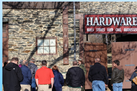
Board showing the history of flood heights in lower town