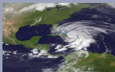
Hurricane Sandy Oct. 29, 2012

Andrea Barry Chantal Dorian Erin Fernand Gabrielle Humberto Ingrid Jerry Karen Lorenzo Melissa Nestor Olga Pablo Rebekah Sebastien Tanya Van Wendy