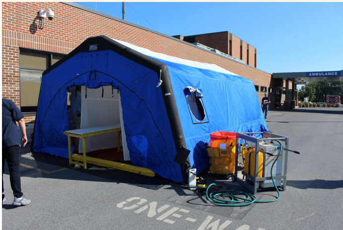
WVU Healthcare, Jefferson Medical Center participated by setting up and practicing their Decontamination capability, as well as activating their Incident Command Center for the exercise.