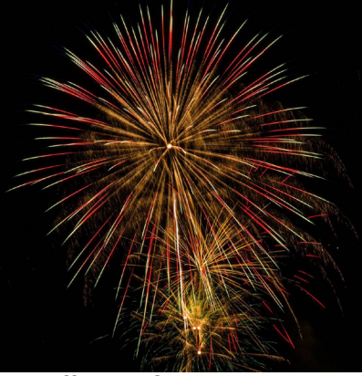
Jefferson County Fireworks 12,000-15,000 visitors and guests join in the fun of celebrating Independence Day at Sam Michael's Park. Free public event paid for with donations.