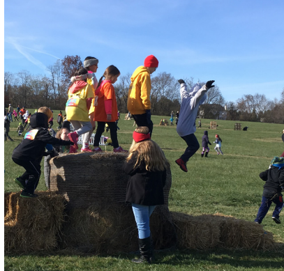
Wee Warrior Dash A partnership developed between Jefferson County Parks, Two Rivers Treads, Freedom's Run, Shenandoah Cooling and Heating, and FLOC. 200+ kids participate in this free event for fitness and outdoors