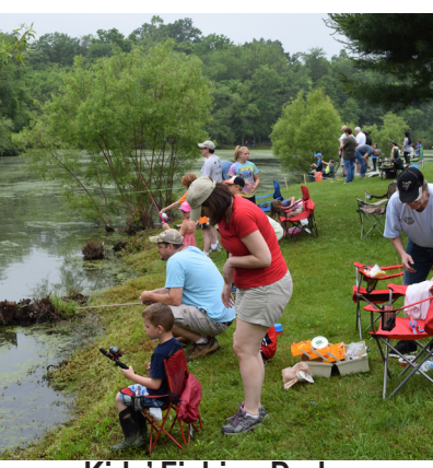
Kids' Fishing Derby Hosted by the Izaak Walton League in partnership with JC Parks and Jefferson Securities Bank. Free event. 300 kids are invited to fish and earn prizes.