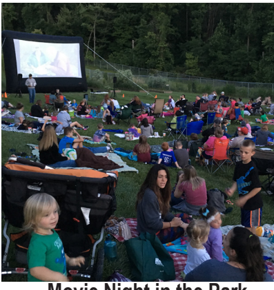
Movie Night in the Park Six movies were shown in various locations in Jefferson County in partnership with cities, businesses, and Jefferson County Schools

Community Events are planned and designed to serve the population of Jefferson County, as well as attract visitors to Jefferson County from outlying counties and states.