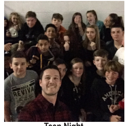
Teen Night Middle School Teens are invited to the Jefferson County Community Center each night for activities and an opportunity to spend time with their friends.