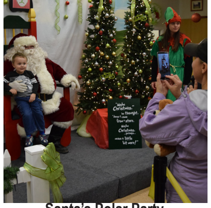
Santa's Polar Party A celebration of the Christmas Holiday, bringing 300+ kids and their families to the Jefferson County Community Center to celebrate Santa!