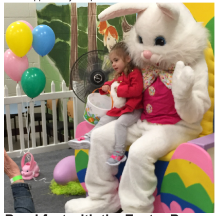
Breakfast with the Easter Bunny 200+ kids and their families hunt for 6000 easter eggs, enjoy crafts, pancakes, and a visit with the bunny!