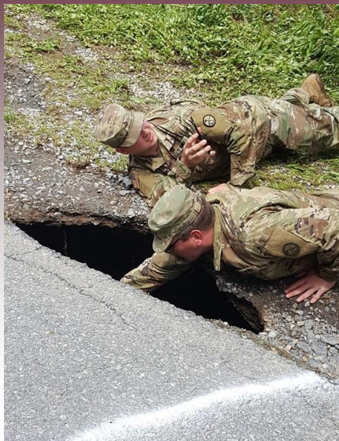
Top Right: A West Virginia National Guard Community Assessment Team is inspecting a sink hole on Bloomery Road. Taken on June 5