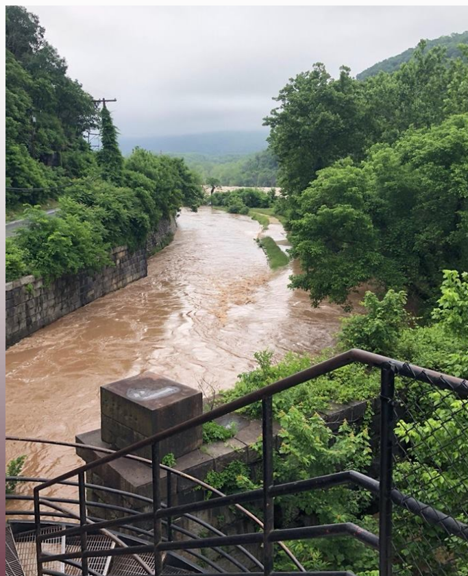
Bottom Right: The Potomac River at Harpers Ferry National Historic Park. Taken on June 4