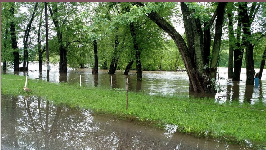
Top Left: Minor Flooding from the Shenandoah River on Bloomery Road. Taken on May 19.