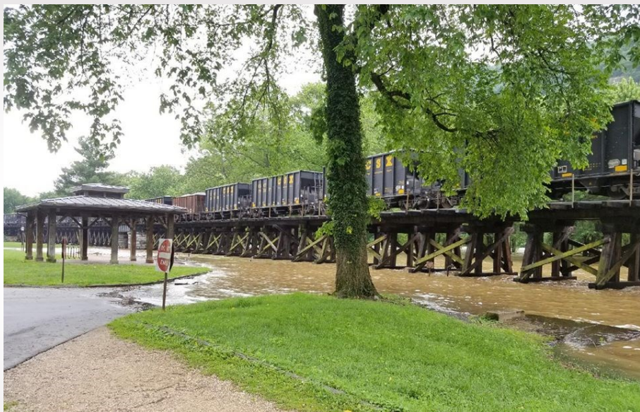
Bottom Right: Damage left behind from the Shenandoah River Flooding at Moulton Park. Taken on June 8.