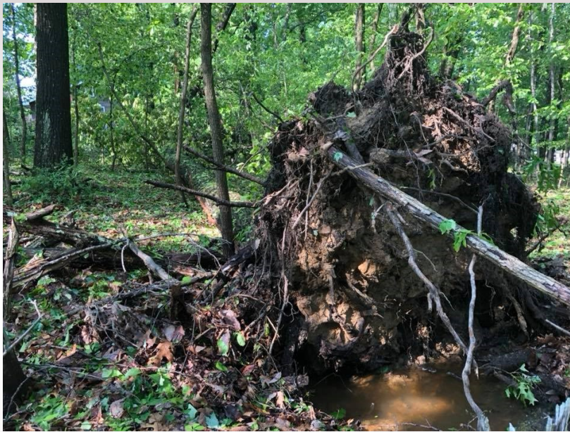
Top Left: Flash Flooding on Cub Run, Shannondale, WV. Taken May 14