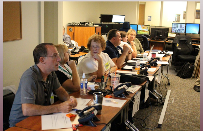
Left: 2017 Functional Exercise. Right: 2017 Full Scale Exercise