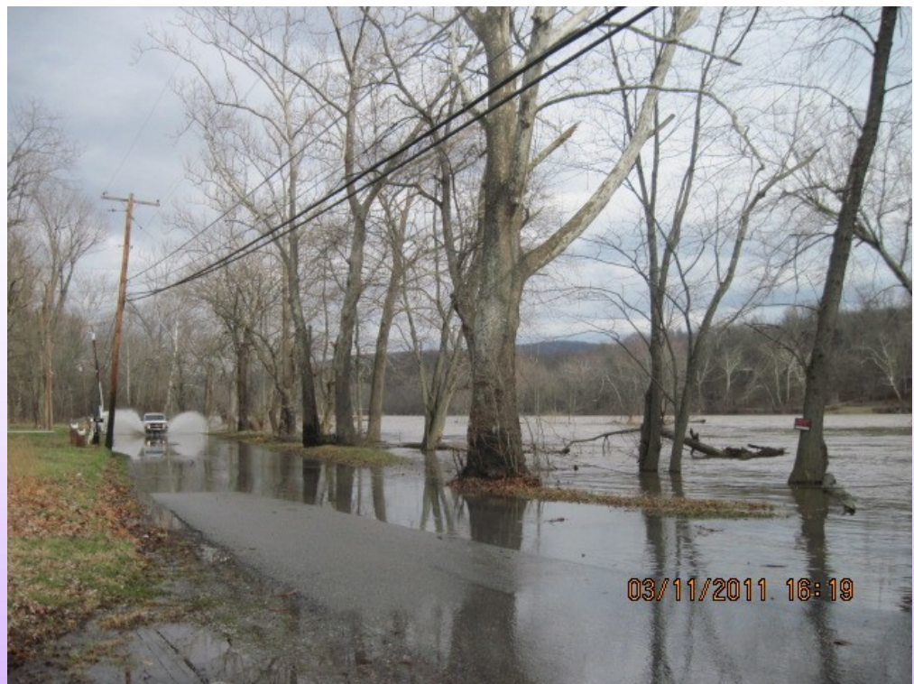
A vehicle drives through an already-flooded roadway in March, 2011 on Bloomery Road.