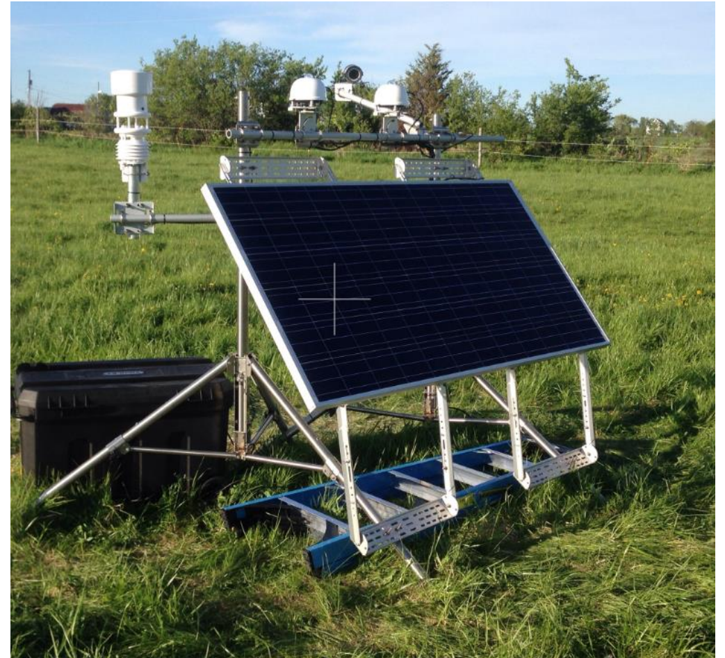
Solar Met Station