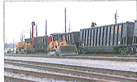
Crews work on repairs on Wednesday, Jan. 18, 2012, where a train derailed near the Cabell-Huntington Health Department in Huntington.