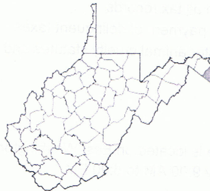
Location in the state of West Virginia